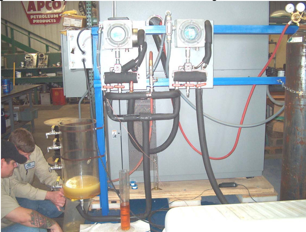
Figure 1. Photograph of Small Scale Test Unit for Blending Biodiesel and Diesel Fuel